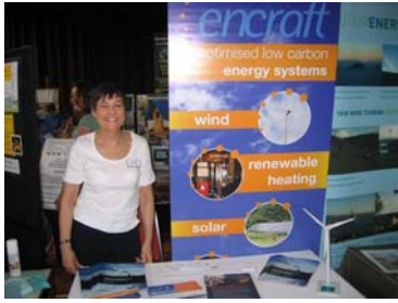
Stratford Eco-Fair—stalls and the Mayor with a 'green' Shakespeare