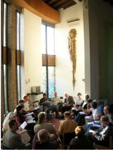
Workshop at Christian Ecology Link conference in Lancaster in 2007

More details are available on the Redcliffe website at www.redcliffe.org/environment09 .