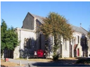
St Paul’s, Chichester