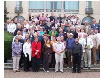
ECEN members at Villa Sacro Cuore, Triuggio near Milan