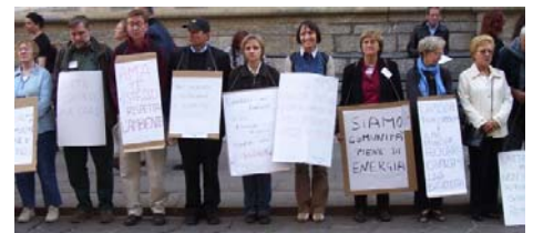
Our Hour of Silence outside Milan Cathedral

Others were giving out leaflets explaining what we were doing.