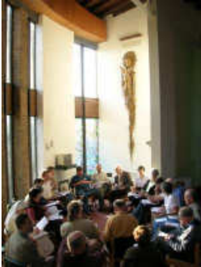
Workshop at Christian Ecology Link conference in Lancaster in 2007

More details are available on the Redcliffe website at www.redcliffe.org/environment09 .