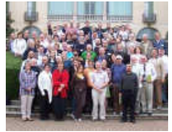
ECEN members at Villa Sacro Cuore, Triuggio near Milan

Others were giving out leaflets explaining what we were doing.