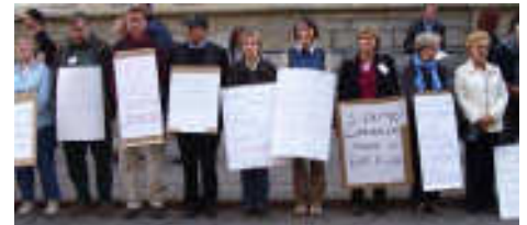
Our Hour of Silence outside Milan Cathedral