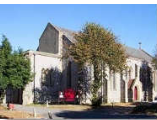
St Paul’s, Chichester

At St Paul’s Chichester, they have been active in going deeper in terms of their environmental mission since receiving their Eco-congregation Award. For example: