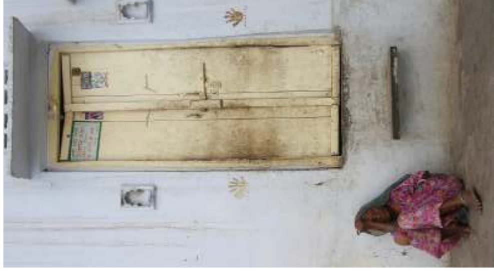
Without an access to education in schools many doors to careers are closed to the children in Rajasthan