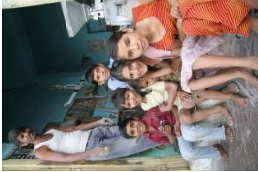
In the villages of Rajasthan children of all ages go about their daily lives without shoes on their feet.