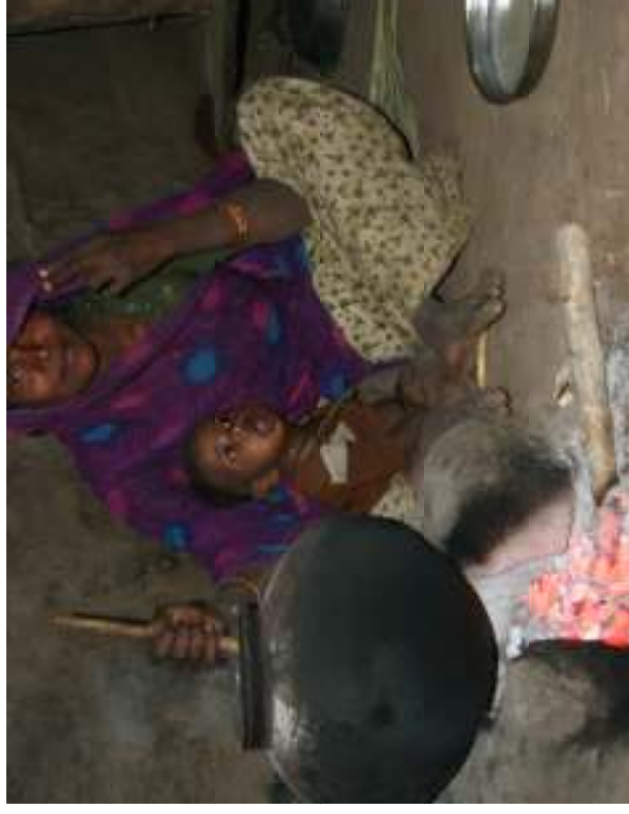
Here is a mother in a village in Rajasthan preparing a meal for her family....does your kitchen look like this?