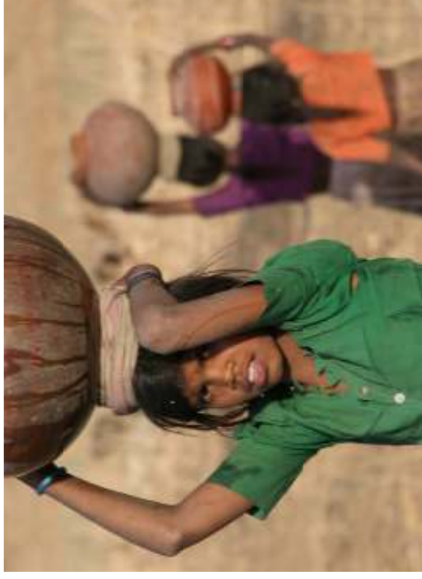
Young girls in Rajasthan are expected to help their mothers with the collection of water for the family